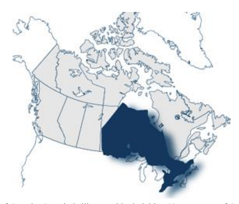
Figure 1. Map of Canada, Ontario is illustrated in dark blue (Government of Canada 2016).

Oak regeneration from prescribed fires is important to consider the best management techniques that should be used in oak-dominated stands. Proper management techniques are important in high value stands such as oak because of the need for high-quality stock that will provide a profit when selection cut. This thesis will take an in-depth look at the history of oak, the biology of oak, and the processes of oak regeneration. The focus will be on oak regeneration as a result of fires in Canada, with a special focus on Ontario, refer to Figure 1. The research conducted on oak regeneration will be through a compilation of various academic articles.