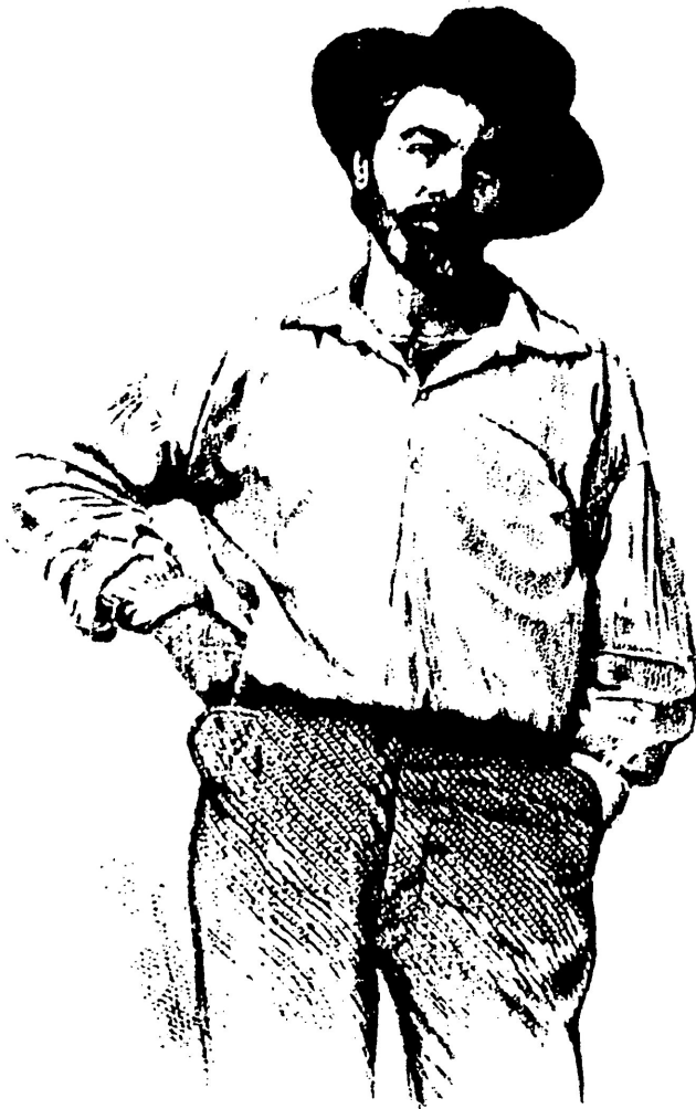
Picture of Walt Whitman from the 1855 Edition of Leaves of Grass .